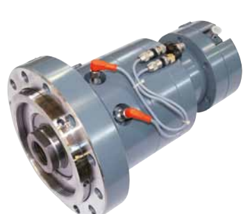
Hydraulic cylinder with mechanical interlock