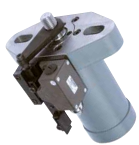
Hydraulic cylinder with attached limit switch operation