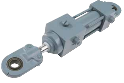
Standard cylinder DIN/ISO series

Are you looking for hydraulic cylinders which are fully compatible with national and international standards without dispensing with the proven technology and quality of HYDROPNEU? Then our standard cylinders according to DIN/ISO are perfect for you. Standardized mounting dimensions and standardized installation dimensions for seals, its modular construction and the use of standard parts for components and accessories ensure maximum flexibility in terms of maintenance and replacement. The chosen materials and manufacturing processes meet the high quality demands of HYDROPNEU.